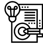
TACTICAL PLAN OVERSIGHT