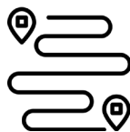
NIST CSF MATURITY ROAD-MAPPING

Virtual Chief Information Security Officer as a Service can provide both part-time and temporary CISO solutions. We provide highly-qualified interim CISOs while you search for a permanent candidate. GDT can also fill the role on an ongoing, part-time basis to oversee and direct your program.