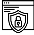
APP & ENDPOINT PENETRATION TESTING