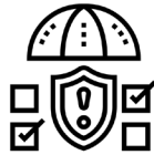
RISK MANAGEMENT & MITIGATION