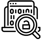
NETWORK PENETRATION TESTING