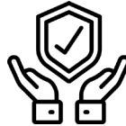
SECURITY COMPLIANCE AS A SERVICE