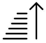
SECURITY BEST PRACTICES ALIGNMENT